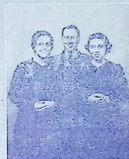
MISSION BAND EXECUTIVE