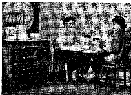
A Corner of One of the Newly Decorated Dormitories

Our Building Fund is being kept open and all donations received for this fund will be used to pay off the $20,000 mortgage on this new addition.