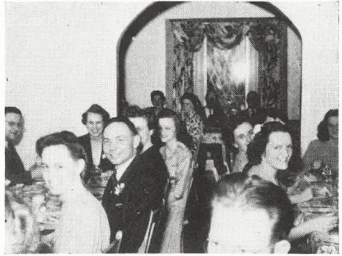
Part of the group at the Alumni Banquet