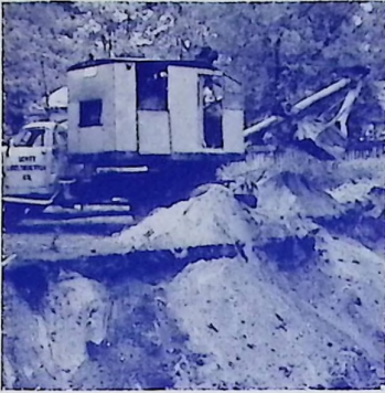
Remember When Our New Building Was Just a Hole in the Ground?