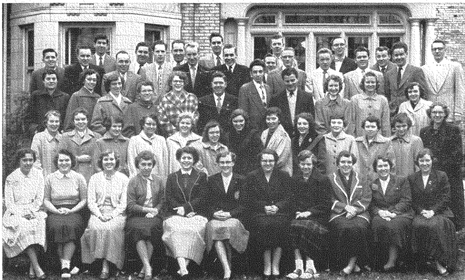
First Year Students — 1955 - 56

At L.B.I. we believe that we have special cause for thanksgiving to God as we recognize His favour in again sending us a fine group of new students. Most of them come from Ontario, but Saskatchewan, Quebec, New Brunswick, and Nova Scotia; New York, Pennsylvania, and Michigan are also represented in the Freshman class.