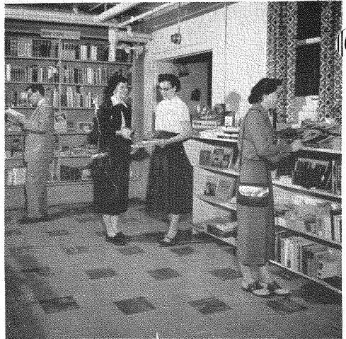
A corner of our new Book Room.