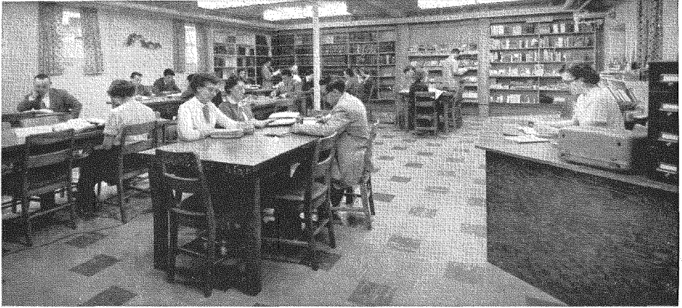
A Section of the Study Area in our New Library

Facilities of our new Library are available to Pastors, Christian workers and friends of the Institute.