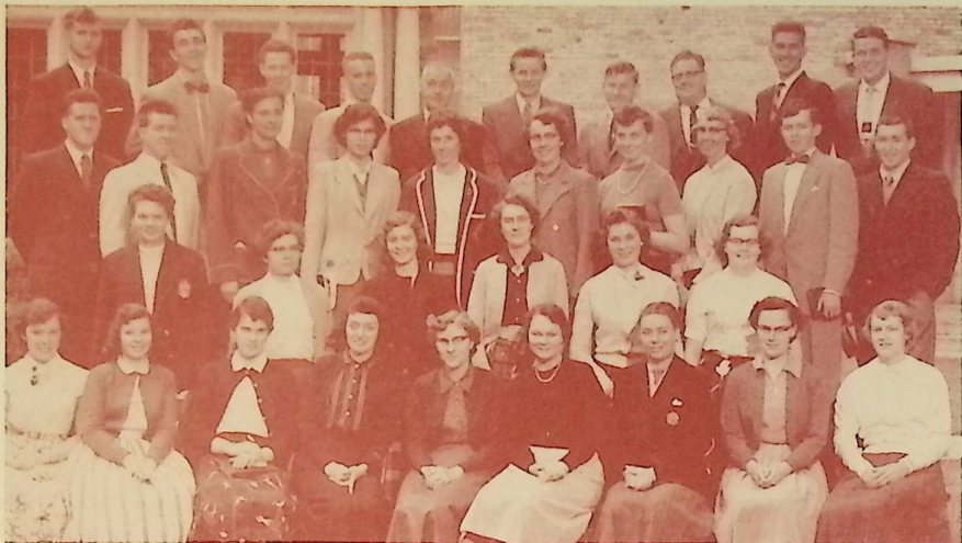
Pictured above are the new students who were registered by Monday, September 10. Nine others not shown above have been enrolled since this date.