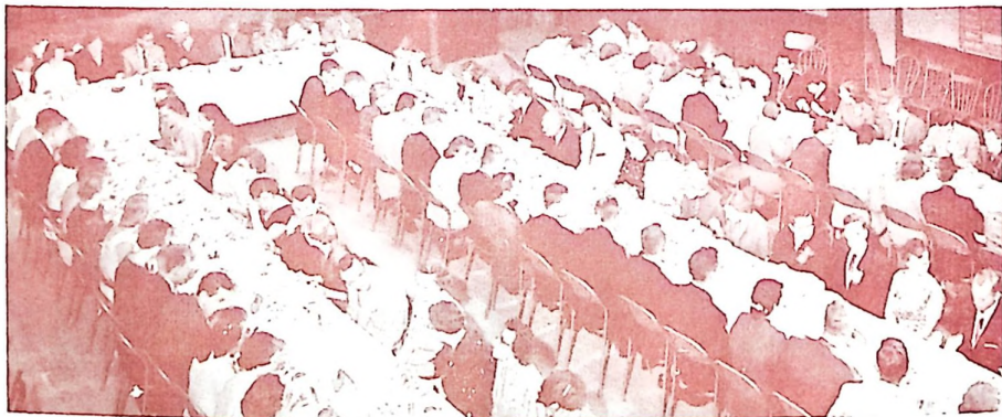
Orientation Banquet — Friday, September 7

Thus we thank God that He uses the testimony of His own! From Gypsy caravan to home church, to rural Sunday School, to busy city church—God has been using His servants to preach the gospel throughout this past summer. You have been praying; God has wonderfully answered. From our hearts there bursts forth the anthem of praise, "To God be the glory—great things He hath done."