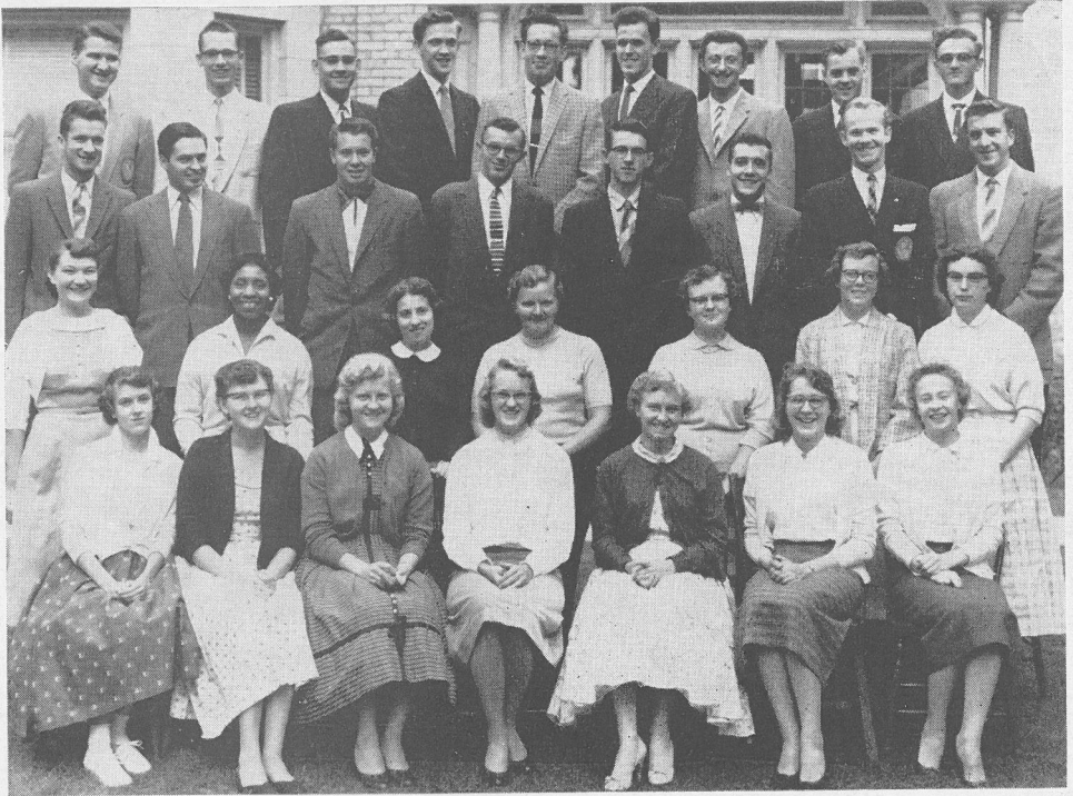
Pictured above are the new students who were registered by Friday, September 6. Ten others not shown have enrolled since this date.