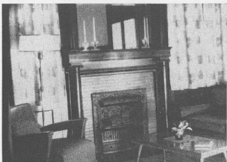
Reception Room, Men's Residence.

At the conclusion of the Dedication Service, the many friends of the school who had gathered for this memorable occasion, retired to the Hooper Memorial Chapel for a Service of Welcome for the new students. Afterwards, the large crowd enjoyed a time of fellowship on the lawn of Mahood Hall, at which time, too, the entire plant of the school was opened for public inspection. When the evening's schedule had concluded it was the general consensus of opinion that not only had a blessed evening been spent but that also another year freighted with blessing appeared to lie ahead of L.B.I.