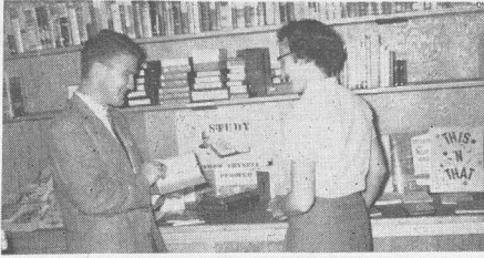
New Book Room

This Year Shop Early for Christmas . . .