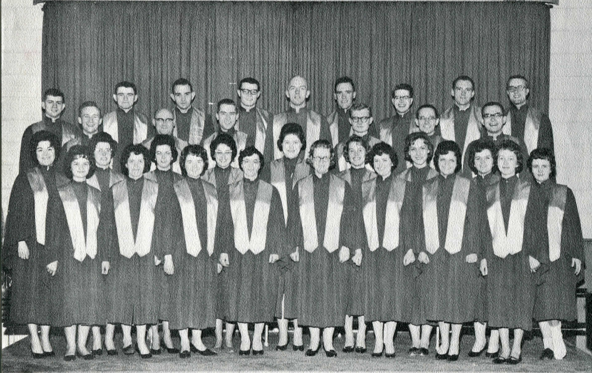
LCBM CHORALE COMMENCES TOUR IN MARCH