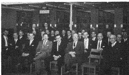
London College of Bible and Missions was pleased to host 38 Associated Gospel Church pastors as they met at the school on May 6 for their monthly Pastors' Day.