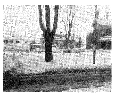
Now the site is a parking lot.

The past interests and inspires us but we must face the future, for it is ahead. As London College again makes plans to care for our expanding enrollment and academic program, will you stand behind us with your prayers and with your financial assistance?