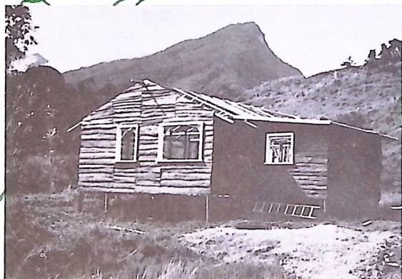
STUDENTS BUILD MISSION RESIDENCE