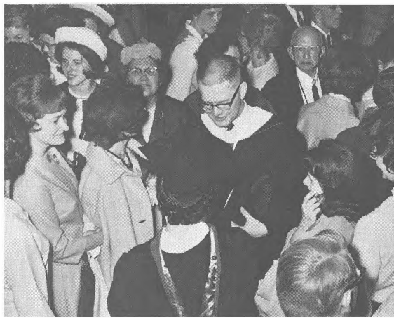
After they received their degrees and diplomas, the graduates were greeted and congratulated by friends, faculty and fellow students before departing to begin the next phase in a life dedicated to the service of Christ.