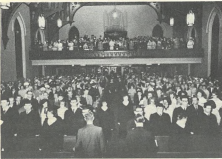
A capacity audience stood as the twenty-eight graduates marched into First St. Andrew's United Church for the Commencement Service.