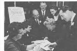
Alumni registering for Homecoming

On Friday afternoon, the music department presented a musicale. A varied program included a hymn sung by the choir and a solo