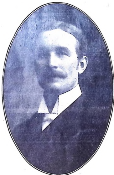
The New Secretary.

great pleasure in the fact that 130 of our students have gone to the foreign field, a much larger number have devoted their lives to spheres of service at home, and it is the purpose of the College to so train young men and women from all the churches in the knowledge and use of the English Bible that they will be useful workers in the cause of Christ wherever they are found. Further the scope of the course of study has been extended to cover three years, and is of such a character as to bring its work fully on to a Collegiate standing.