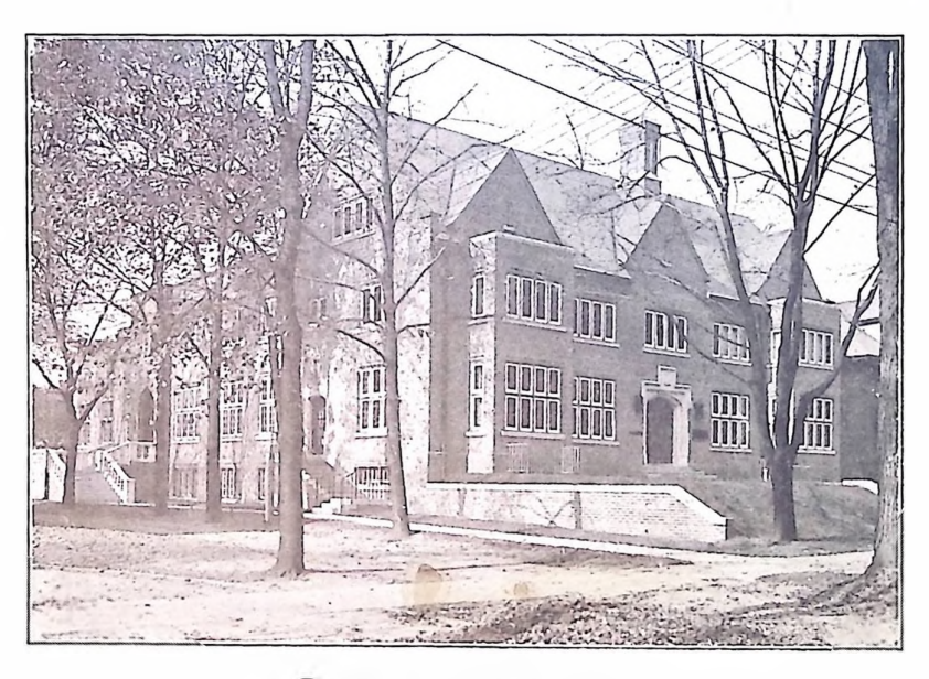
The New Bible College Building

Cordial Christmas Greetings to all Friends und Former Students