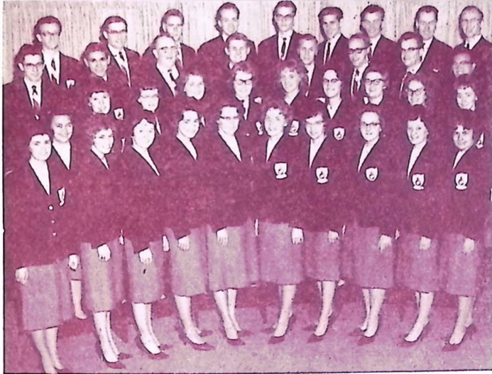
The T.B.C. 40 Voice Choral, 1963.