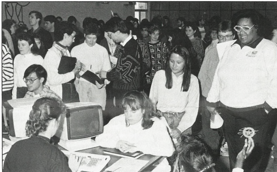
Spring semester registration of full and part-time students was strong. At OTS 411 credit and 28 audit students enrolled. At OBC 343 enrolled in the daytime credit programs and 161 in the evening school credit division. As well in the evening school, 63 enrolled in diploma courses and 40 in the satellite schools.