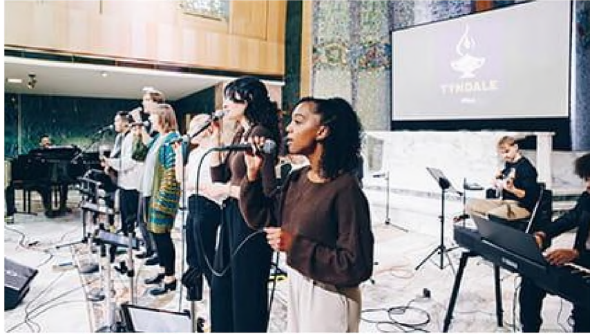
University students lead music during a chapel gathering.

formation prepares students for careers in music in the church and the marketplace.”